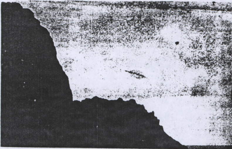
JUST visiting? An unidentified flying object spotted off the Brazilian coast in 1958, an event which also forms part of the author's fascination. (5)

"From another dimension, it's difficult to choose between these two but, if UFOs are ever explained, it certainly will teach us a lot about the human race and our world," said the Shipley-based author.